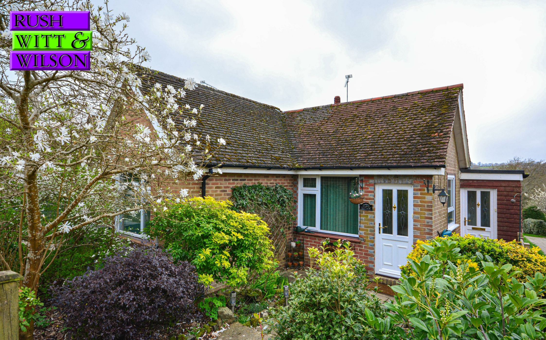
Stable Cottage, Wattles Wish, Battle, East Sussex TN33 0JG £425,000